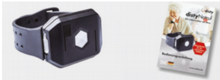
distyNotruf with wrist band