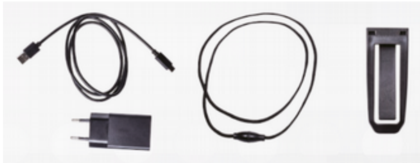
power Supply & Charging cable